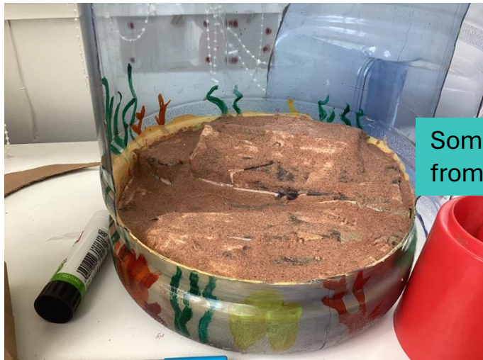
Some artwork from students