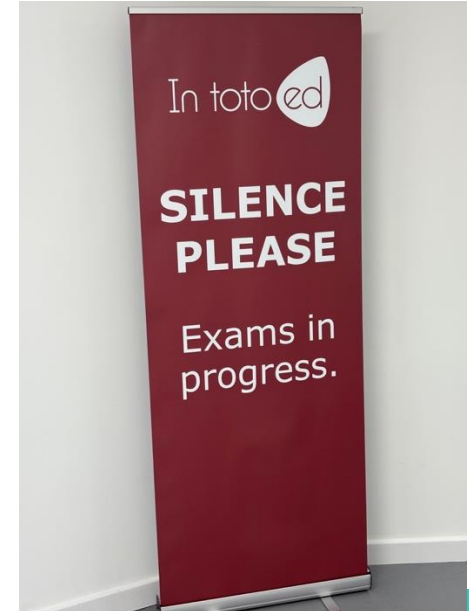
In Toto Ed Peterborough's exam arrangements