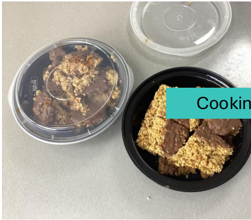
Cooking at In Toto!